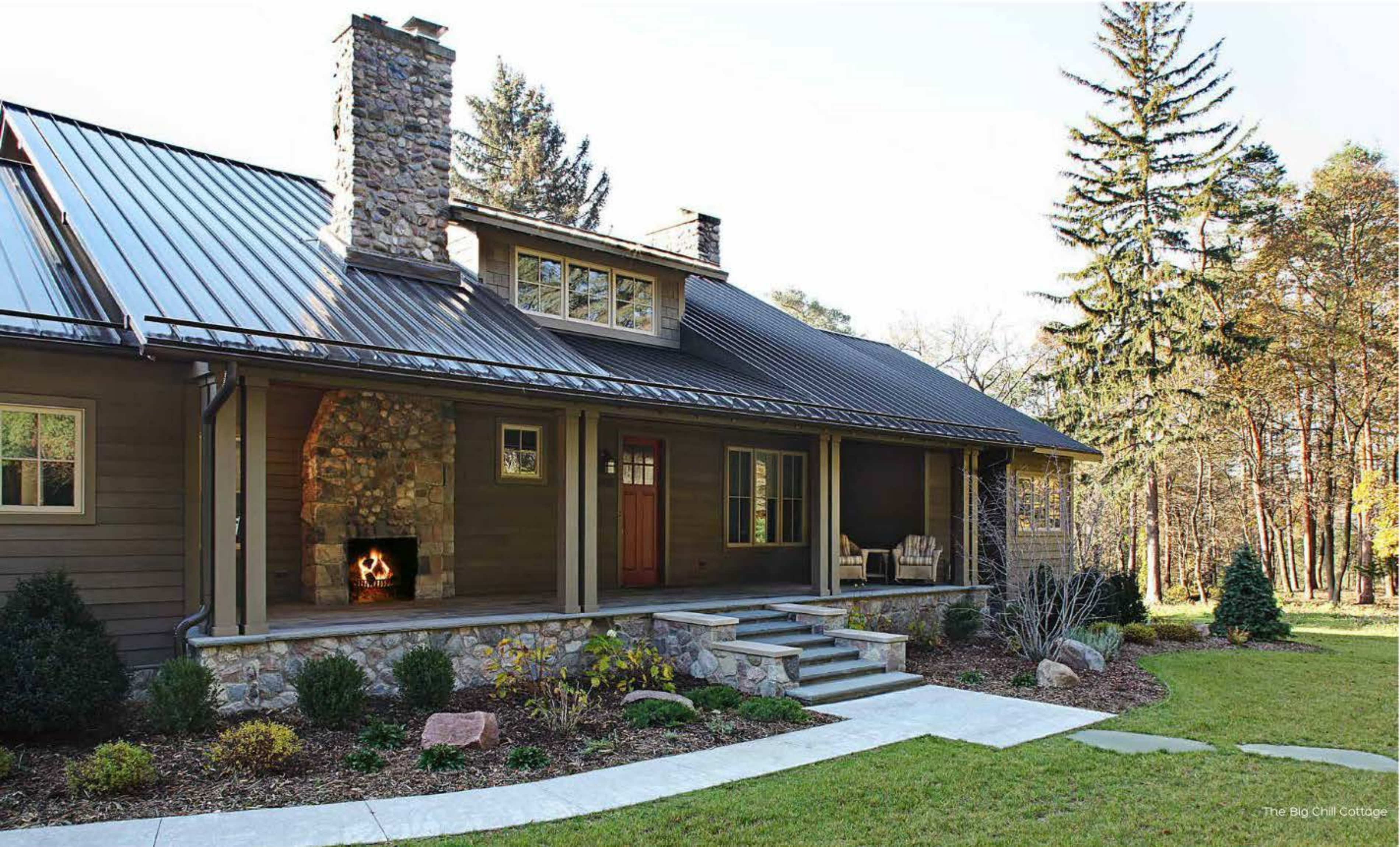
The Big Chill Cottage