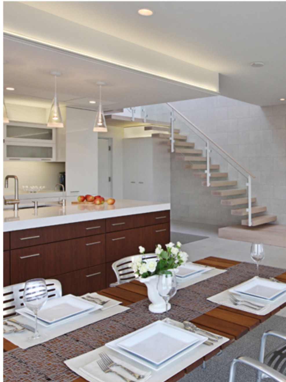
Angelini & Associates Architects