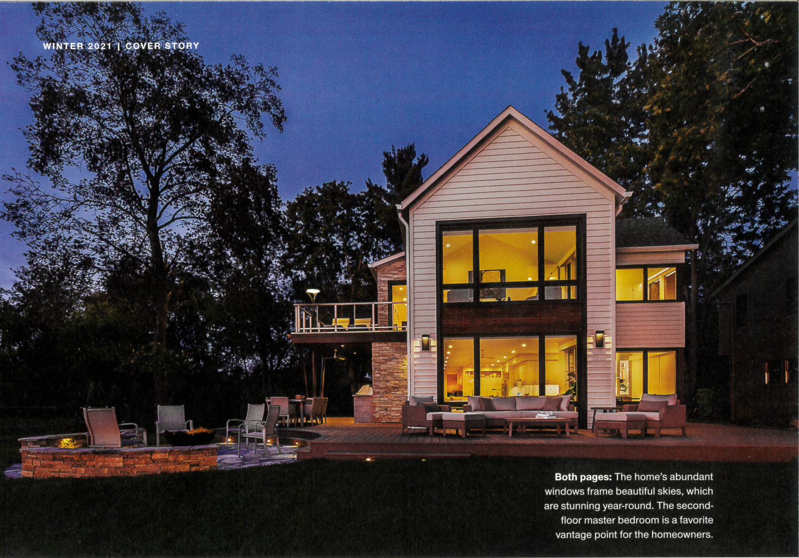
Both pages: The home's abundant windows frame beautiful skies, which are stunning year-round. The second-floor master bedroom is a favorite vantage point for the homeowners.

"When it got smaller, it got better." Others agreed; the firm and the project won a Huron Valley American Institute of Architects design award, with one judge remarking: "Well-organized site use ... feels much larger than it is."